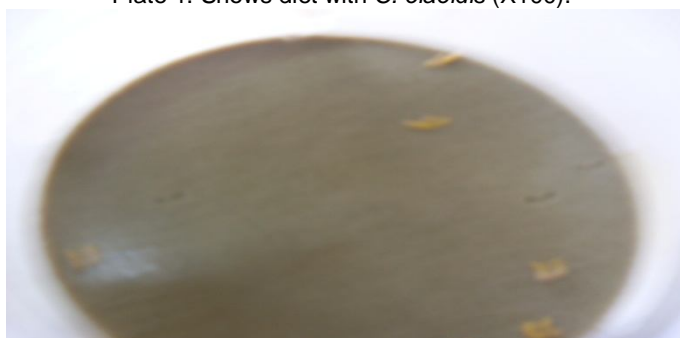
Plate 1. Shows diet with C. elaeidis (X100).

Larval and parasitoid rearing: The rearing cages and containers were kept in the laboratory. Prior to infestation, the glass vials were sterilized in a steamer and oven dried. The diet was poured in while hot. The glass vials were half filled. Larvae of C. elaeidis were put in one per glass vial. Infestation took place after the diet had cooled and its surface scarified to ease larval penetration. All infestation was done under a laminar flow station which ensures sterilized air. Serviette paper was used to cover the rearing cages to prevent humidity build-up and prevent larval escape. Cotton wool soaked with sugar solution was provided for feeding of C. elaeidis larva when placed in a plastic cage to observe parasitoid attack on it. Adult parasitoids were fed with sugar solution to observe longevity.